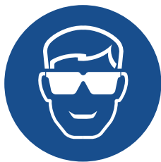
Tightly sealed goggles

The exact break through time has to be found out by the manufacturer of the protective gloves and has to be observed.